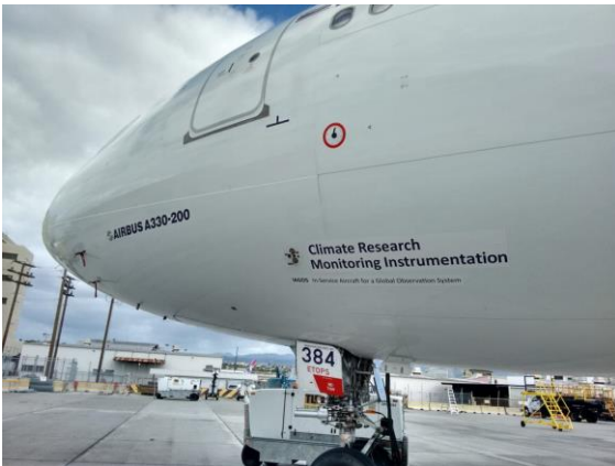
IAGOS